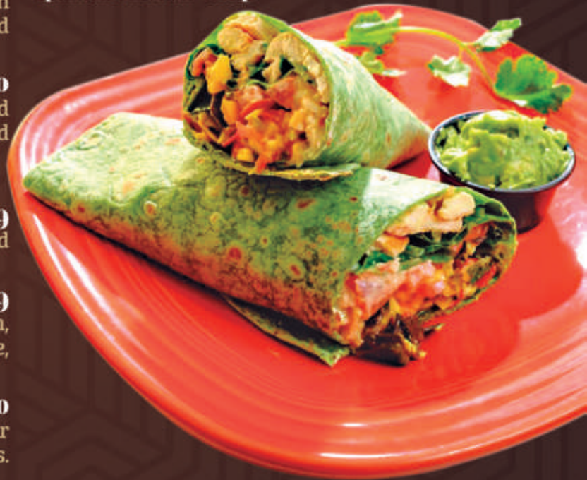
Spinach Chicken Wrap

A classic Mexican pork sandwich with avocado, tomatoes, lettuce, pickled jalapeños, and sour cream. Served with a side of fries.