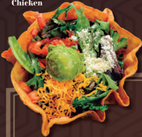
Taco Salad Fajita Chicken