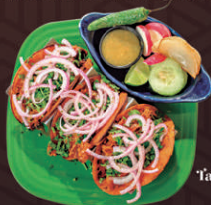
Tacos al Pastor