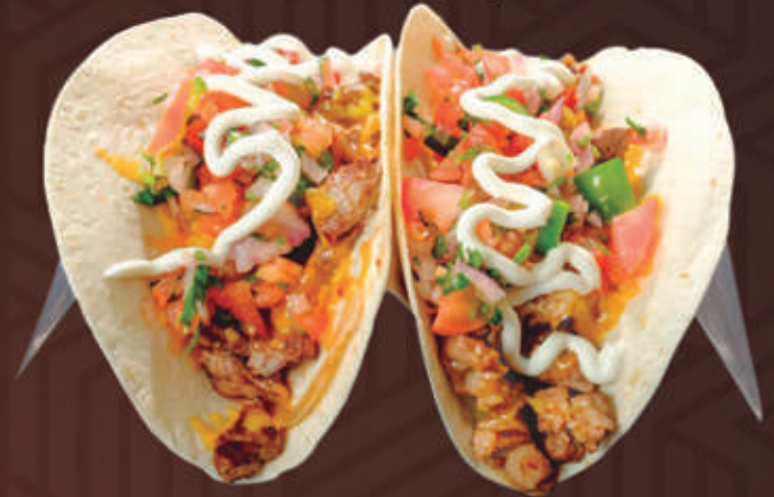
Tacos El Maguey

A large deep fried flour tortilla stuffed with shredded chicken or ground beef. Topped with cheese dip. Served with guacamole, rice, and beans.